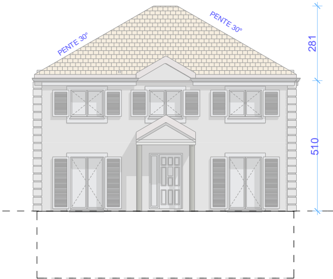
FACADE AVANT ECHELLE 1/150